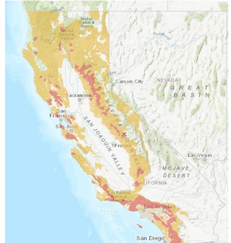
CPUC Wildfire Map 1